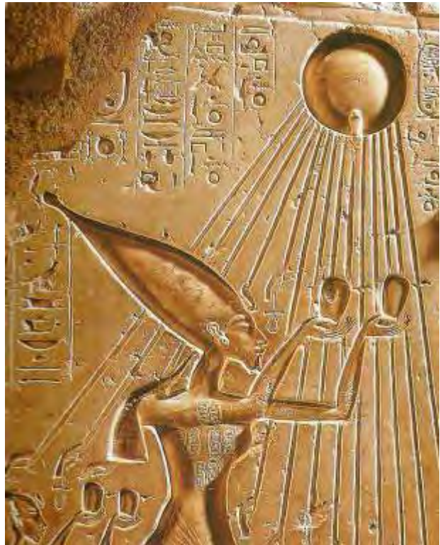
Akhenaten worships the sun. Check out the hands at the ends of the rays, handing him an Ankh, saying, like, "Get a bit of eternal life into ya, mate."

I know, I know, you're probably saying, 'Aussies worship the sun, too.' But I'm not talking about catching rays and hitting the beach. Akhenaten actually worshipped the sun. He believed the sun's rays were holy life-giving rays of solar-y goodness. The sun's light was actually the sun-god touching the people.