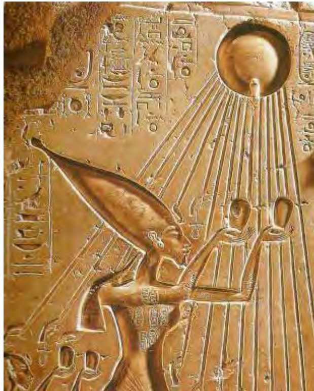
Akhenaten worships the sun. Check out the hands at the ends of the rays, handing him an Ankh, saying, like, "Get a bit of eternal life into ya, mate." National Geographic.

I know, I know, you're probably saying, 'Aussies worship the sun, too.' But I'm not talking about catching rays and hitting the beach. Akhenaten actually worshipped the sun. He believed the sun's rays were holy life-giving rays of solar-y goodness. The sun's light was actually the sun-god touching the people.