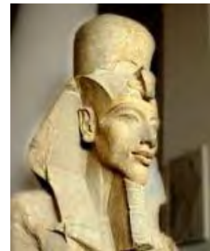
Akhenaten, the radical dude.

Heaps of historians reckon that Tut's dad was this bloke called Akhenaten, aka Amenhotep IV. He was a radical king. Not radical as in 'totes rad, dude', but radical as in he actually changed heaps of stuff about Egypt.