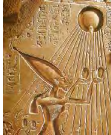
Akhenaten worships the sun.