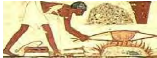
A metal worker

http://www.ancientegypt.co.uk/trade/story/page3.html