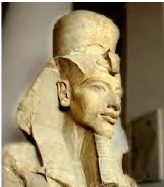
Akhenaten the heretic pharaoh. www.ancient-egypt.co.uk/cairomuseum/cmakhenaten/pages/akhenaten.htm

The traditional religion of ancient Egypt remained fundamentally stable for millennia. Then, in the late eighteenth dynasty, the radical theological innovations of Amenhotep IV (also known as Akhenaten) undermined the status quo, and set up repercussions that reverberated to the end of the pharaonic era.