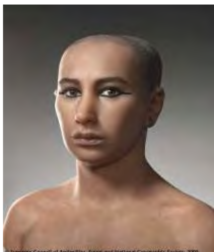
Graphic reconstruction of Tutankhamun's face based on CT scan technology.

When he was about eight years old, Tutankhamun married Ankhesenpaten (later Ankhesenamun), the third daughter of Akhenaten and Nefertiti. Ankhesenamun was possibly Tutankhamun's half-sister, and it is likely that she was about the same age as her husband. It seems that the couple did not have any surviving children, although there were two mummified babies in Tutankhamun's tomb, perhaps their daughters.