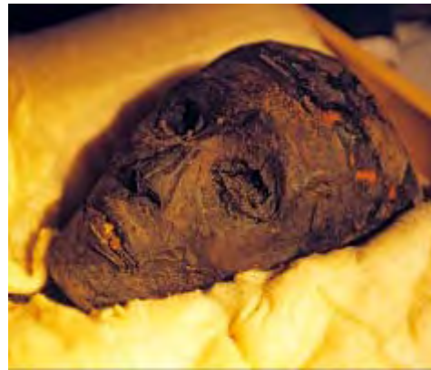
Tutankhamun's mummy. National Geographic.

e.g. Why did ancient Egyptians embalm the dead?