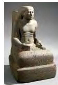
Statue of a scribe

http://www.ancientegypt.co.uk/trade/story/page7.html