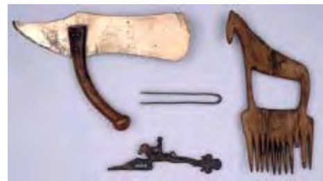
A barber's tools

www.ancientegypt.co.uk/trade/story/page6.html