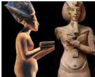
Here it is, man-boobs and beer gut

For a start, he moved the capital of Egypt from Thebes to this place in the middle of nowhere (a bit like Canberra ;-)) called Amarna (ancient name: Akhetaten). That's why people called the time 'the Amarna period'. He built a whole new city out in the desert, man.