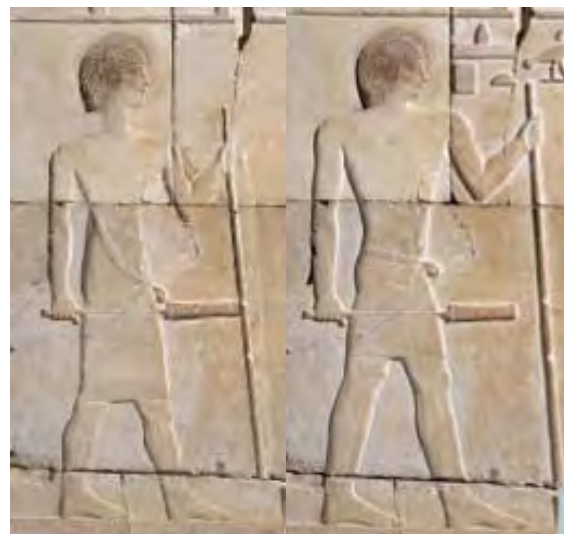
Amarna -style man

Akhenaten fully changed Egyptian art. He was into figures with wider hips, longer necks and smaller legs. Plus, before Akhenaten, pictures of kings were all serious: heavy situations with the gods and the afterlife. But now he made them heaps more playful. Artists made pictures of him doing day-to-day stuff, like hanging out with his wife, pouring drinks for her and generally being a bit of a sweetie.