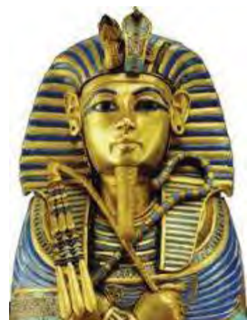
Canopic coffinettes of Tutankhamun. National Geographic.