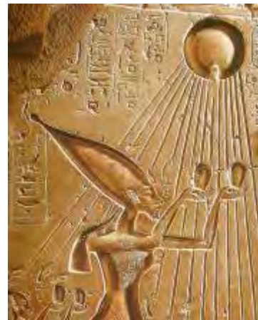
Akhenaten worships the sun.