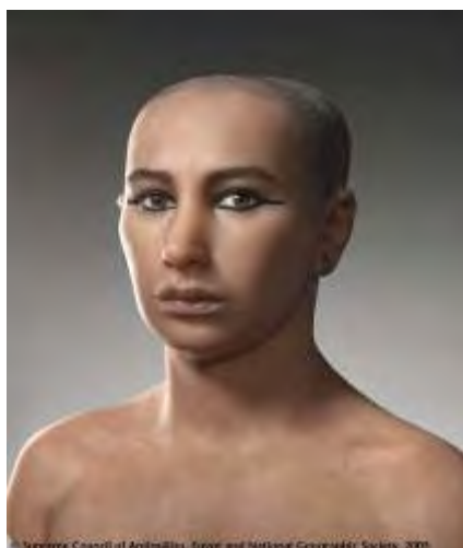
Graphic reconstruction of Tutankhamun's face based on CT scan technology. National Geographic.

When he was about eight years old, Tutankhamun married Ankhesenpaten (later Ankhesenamun), the third daughter of Akhenaten and Nefertiti. Ankhesenamun was possibly Tutankhamun's half-sister, and it is likely that she was about the same age as her husband. It seems that the couple did not have any surviving children, although there were two mummified babies in Tutankhamun's tomb, perhaps their daughters.