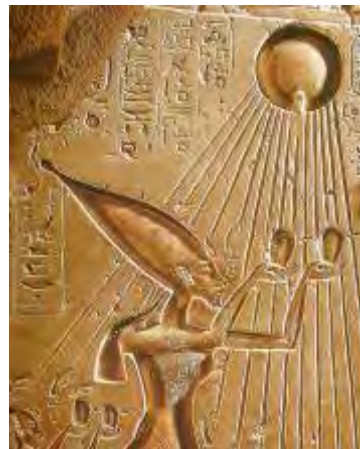
Akhenaten worships the sun.