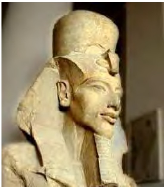
Akhenaten the heretic pharaoh. www.ancient-egypt.co.uk/cairomuseum/cmakhenaten/pages/akhenaten.htm

The traditional religion of ancient Egypt remained fundamentally stable for millennia. Then, in the late eighteenth dynasty, the radical theological innovations of Amenhotep IV (also known as Akhenaten) undermined the status quo, and set up repercussions that reverberated to the end of the pharaonic era.