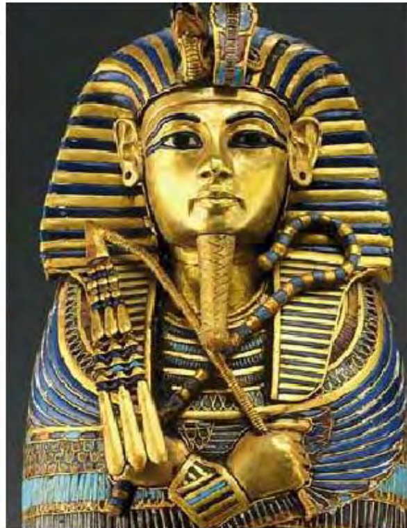
Canopic Coffinette of Tutankhamun