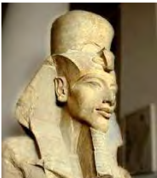
Akhenaten the heretic pharaoh. www.ancient-egypt.co.uk/cairomuseum/cmakhenaten/pages/akhenaten.htm

The traditional religion of ancient Egypt remained fundamentally stable for millennia. Then, in the late eighteenth dynasty, the radical theological innovations of Amenhotep IV (also known as Akhenaten) undermined the status quo, and set up repercussions that reverberated to the end of the pharaonic era.