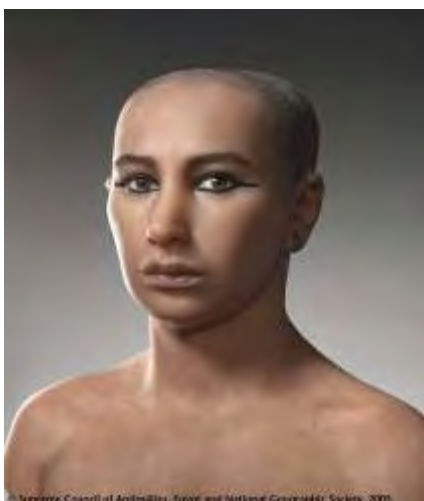
Graphic reconstruction of Tutankhamun's face based on CT scan technology.

When he was about eight years old, Tutankhamun married Ankhesenpaten (later Ankhesenamun), the third daughter of Akhenaten and Nefertiti. Ankhesenamun was possibly Tutankhamun's half-sister, and it is likely that she was about the same age as her husband. It seems that the couple did not have any surviving children, although there were two mummified babies in Tutankhamun's tomb, perhaps their daughters.