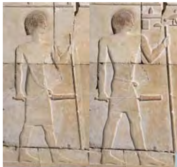
Amarna -style man

Akhenaten fully changed Egyptian art. He was into figures with wider hips, longer necks and smaller legs. Plus, before Akhenaten, pictures of kings were all serious: heavy situations with the gods and the afterlife. But now he made them heaps more playful. Artists made pictures of him doing day-to-day stuff, like hanging out with his wife, pouring drinks for her and generally being a bit of a sweetie.