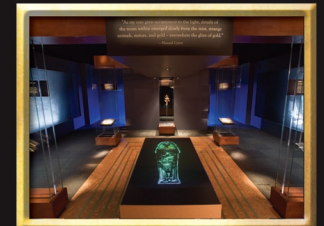
The Burial Chamber