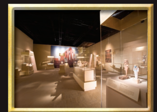
Egypt Before Tutankhamun

MORE THAN 130 ARTIFACTS FROM THE TOMB OF TUTANKHAMUN AND THE GREAT PHARAOHS OF THE 18TH DYNASTY