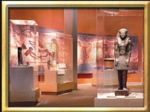
Daily Life in Tutankhamun's World