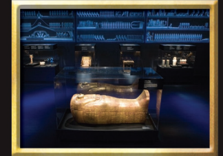
Death, Burial and the Afterlife