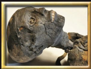
Mysteries of the Mummy