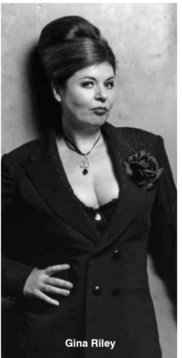
When you're good to Mama, Mama's good to you. Mama Morton